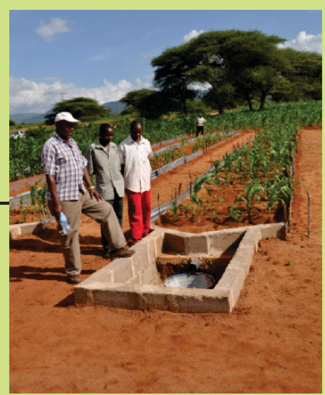
Cost effective soil & water management options